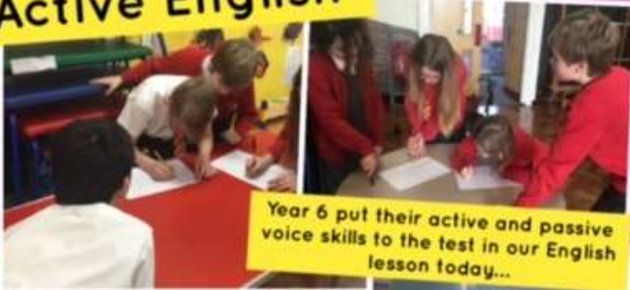
Year 6 put their active and passive voice skills to the test in our English lesson today...