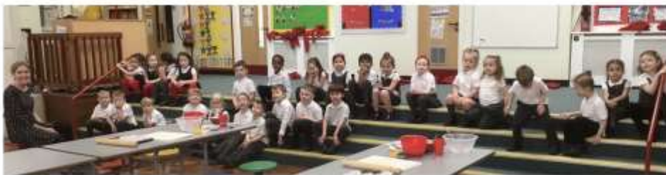
Reception Class enjoyed cooking this week!