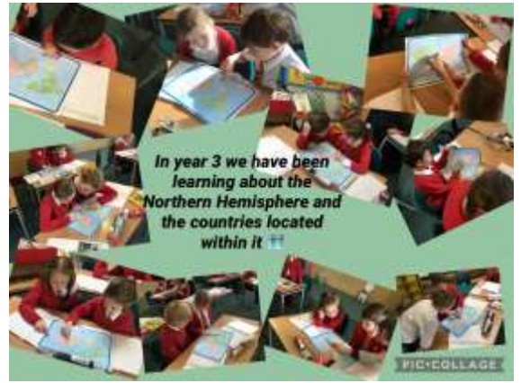
In year 3 we have been learning about the Northern Hemisphere and the countries located within it