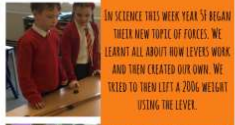
IN SCIENCE THIS WEEK YEAR 5F BEGAN THEIR NEW TOPIC OF FORCES. WE LEARNT ALL ABOUT HOW LEVERS WORK AND THEN CREATED OUR OWN. WE TRIED TO THEN LIFT A 200G WEIGHT USING THE LEVER.