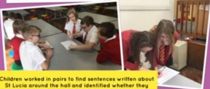
Children worked in pairs to find sentences written about St Lucia around the hall and identified whether they were written in the active or passive voice before changing them into the opposite form.