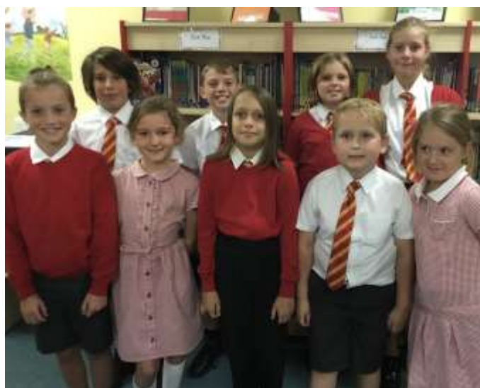
The School Council