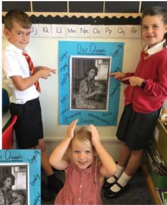
Year 2 came up with some wonderful words to remember our queen 🌟