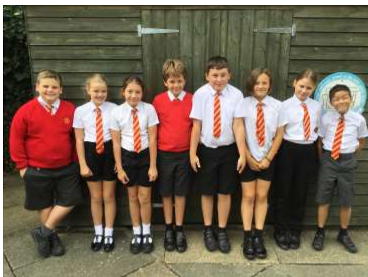
Year 6 House Captains