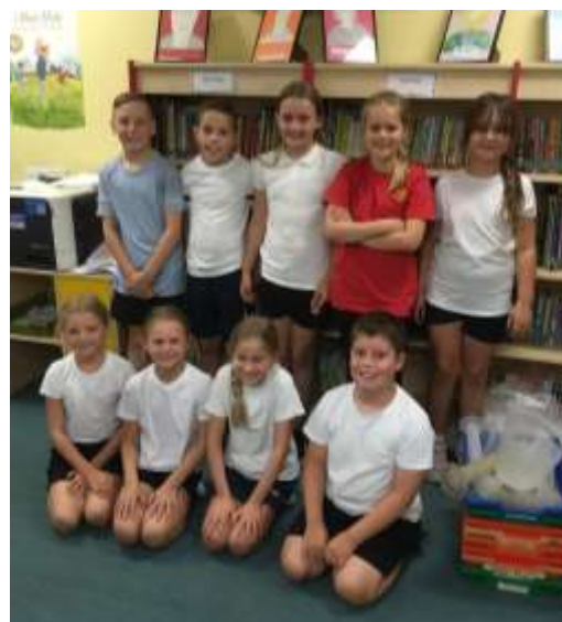
Year 5 Librarians