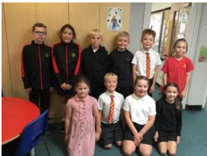
The Green Team