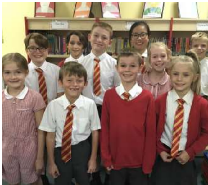
The Sports Council