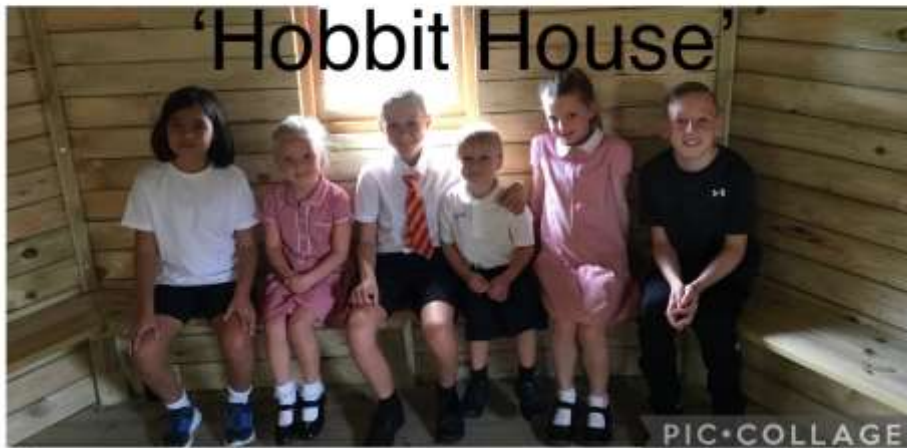
Our new outdoor Theatre